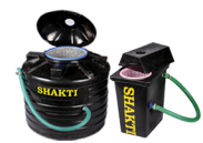
In-Line Grease Trap